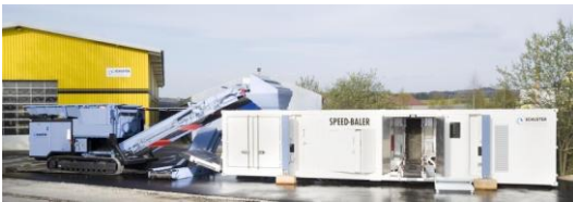
Baling line for bulky materials