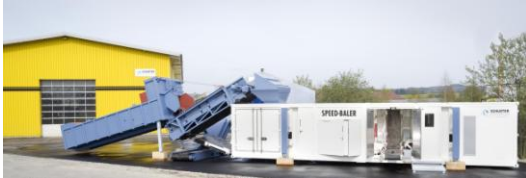
Baling line for prepared material