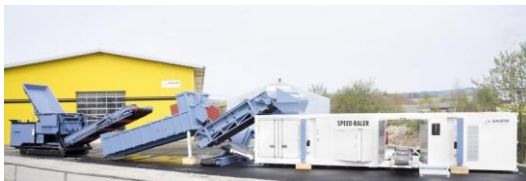
High speed multi purpose line